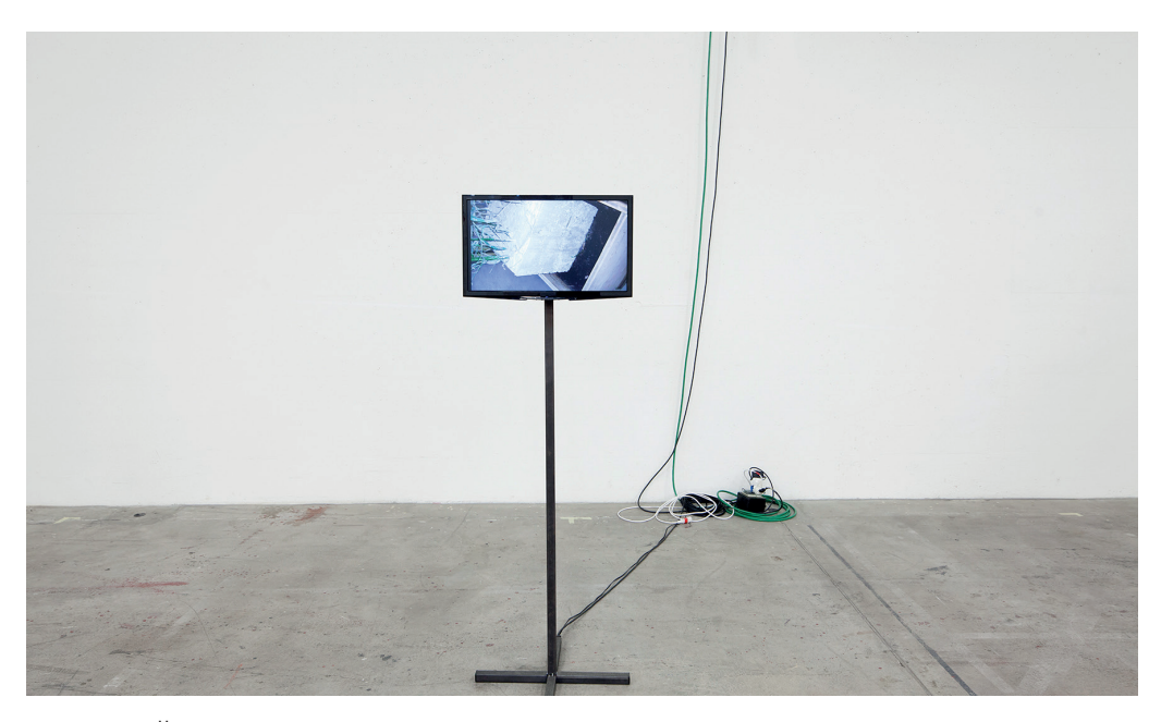
Ramon Feller *1988, Bern/Basel Graduate of HKB (Bern University of the Arts) CHF 15,000

Tropisme, 2014, shock-frozen tropical plants, refrigerated cabinet, 175 x 70 x 600 cm