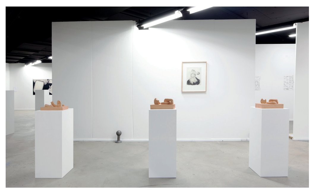
Alfredo Aceto *1991, Geneva Graduate of ECAL (University of Art and Design, Lausanne) CHF 10,000

Monuments to the forgotten art writers that disappeared even if they were good people, 2015, 4 ceramics; Missing Dinosaurs, 2015, charcoal drawing on paper, 75 x 60 cm; A.A., 2015, steel sculptures, 15 \times 30 cm each