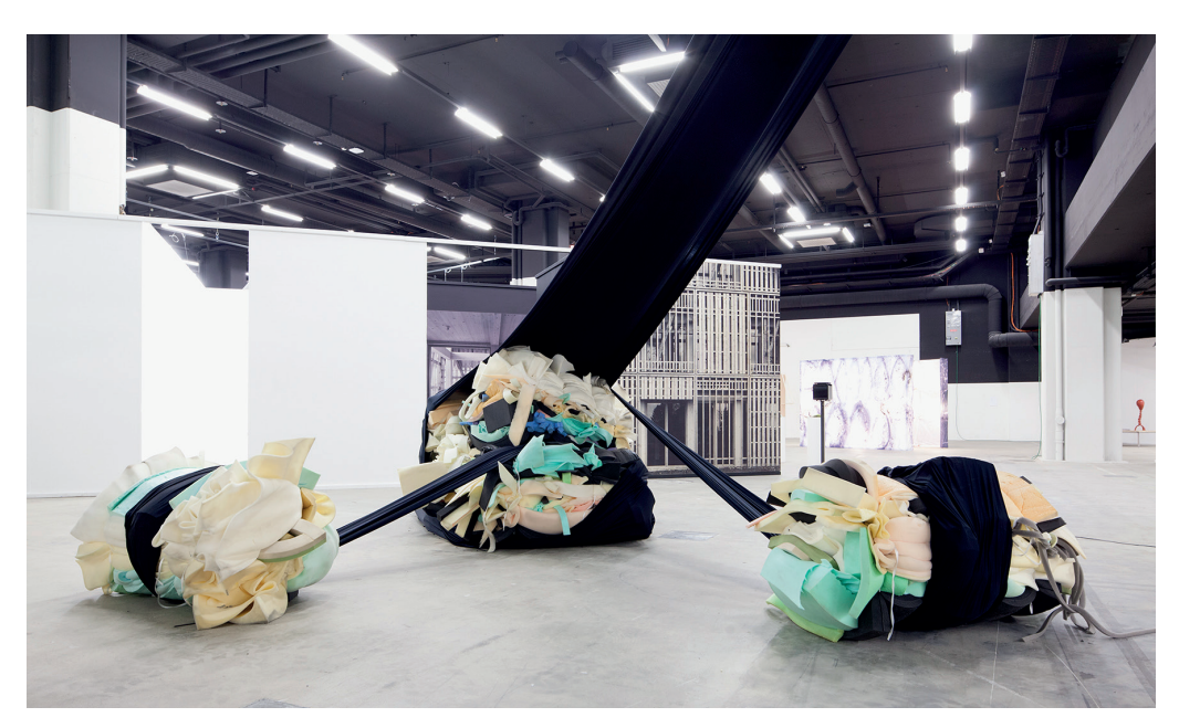
Sonia Kacem *1985, Geneva Graduate of HEAD (University of Art and Design, Geneva) CHF 15,000

Bermuda Triangle (extract), 2015, black Lycra (1.50 \times 80 m), 10 foam bales, dimensions variable