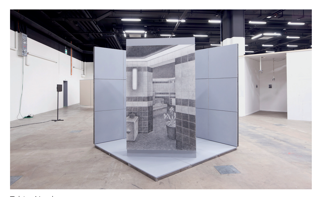
Tobias Nussbaumer *1987, Basel

Bermuda Triangle (extract), 2015, black Lycra (1.50 \times 80 m), 10 foam bales, dimensions variable